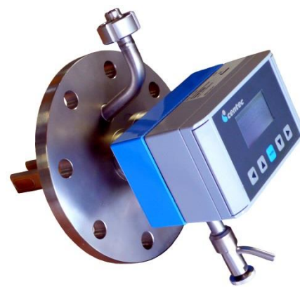
SONATEC HW Transmitter Version for the Wort Kettle