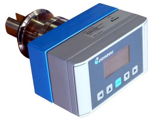
SONATEC Transmitter Version

SONATEC continuously measures the velocity of sound through liquids. Designed for applications that require maximum sensitivity and high accuracy, this device is used in various industries all around the world. Breweries and beverage manufacturers determine extract or dissolved sugar contents in-line with SONATEC. Equipped with an integrated cleaning nozzle, SONATEC HW can be installed directly into brewery wort kettles and evaporators. In numerous pharmaceutical and chemical applications SONATEC is used to control the concentration of acids, caustics and other solutions – but also for monitoring the quality of raw materials and final products. The instrument measures the speed of a sound pulse between a transmitter and a receiver. The sound pulse is created by piezo-elements and moves perpendicular to the product flow. As a specific property of each liquid, the correlation between concentration and sound velocity can be described by a mathematical polynomial. With decades of experience and own laboratory facilities, we have a particular knowledge about polynomials for a huge number of products. Any temperature drifts of the measured signal are automatically compensated for by an internal Pt1000 sensor. SONATEC displays various units, e.g. vol.%, mass %, °Brix and °Plato.