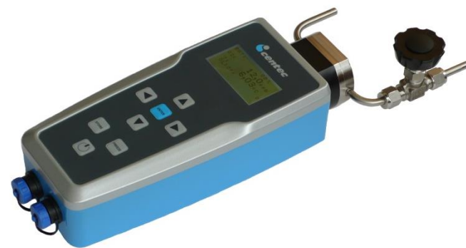
OXYTRANS M Portable Version