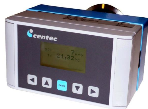
OXYTRANS TR Transmitter Version

OXYTRANS continuously measures the content of oxygen in liquids and gases. Designed for applications that require maximum sensitivity and high accuracy, this device is used in various industries all around the world. Breweries and soft drink manufacturers determine the O 2 content in deaerated water and beverages with OXYTRANS. Oxygen measurement during fermentation is an ideal application. Numerous power plants use the sensor to monitor oxygen levels in their boiler water. The state of the art optical measurement technology is based on the effect of luminescence quenching, i.e. the radiationless redistribution of excitation energy via a molecular interaction. An indicator layer on a small glass component (“optical window”) installed in the measuring head is illuminated with blue-green-light. When the indicator molecules absorb the incident light they are promoted to a higher energy state. After a certain time they convert back to their ground state during which a detectable red light is emitted. If O 2 is present the energy is transferred from the indicator molecules to the oxygen. The detected signal decreases according to the oxygen content. OXYTRANS displays various units, e.g. ppb, ppm and % oxygen. The lightweight portable device is very robust and can easily be connected with hoses.