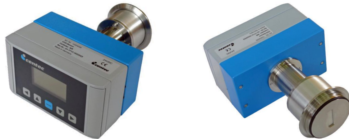
CARBOTEC NIR Transmitter Version

CARBOTEC NIR revolutionizes continuous dissolved CO 2 measurement in liquids. Designed for applications that require maximum sensitivity and high accuracy, this innovative device is ideally suited for food and beverage manufacturers – especially for breweries and soft drink plants. The new generation of CARBOTEC sensors is based on Attenuated Total Reflection (ATR) technology. While transmitting a sapphire glass crystal, near infrared (NIR) light is reflected several times at the surface. The surface of the crystal is in contact to the carbonated liquid. Since the CO 2 molecules in the liquid absorb the specific wavelength of the transmitting light, each reflection decreases the intensity according to the CO 2 content. The sensor is of extreme precision and provides “true” carbon dioxide content by quantifying the infrared absorption of the dissolved CO 2 only. The measurement result is not influenced by any other gases such as nitrogen in beer. Due to the lack of moving parts, the instrument is virtually maintenance free. Any temperature drifts of the measured signal are automatically compensated by an internal Pt100 sensor.